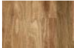
Spotted Gum Light to dark brown with some reddish tones