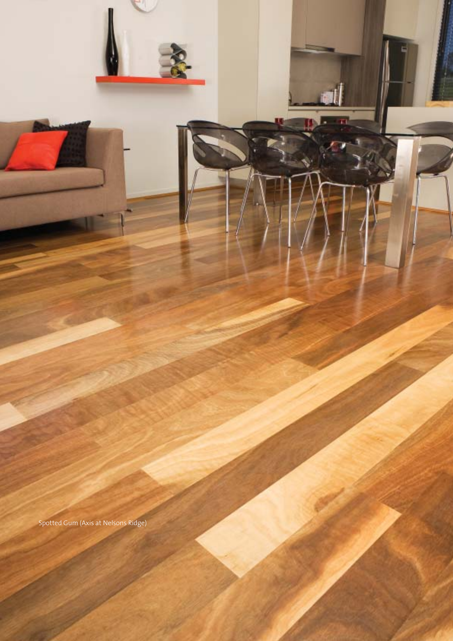
Spotted Gum (Axis at Nelsons Ridge)