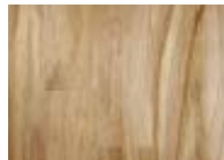
Alpine Ash Yellowish brown to pale pink